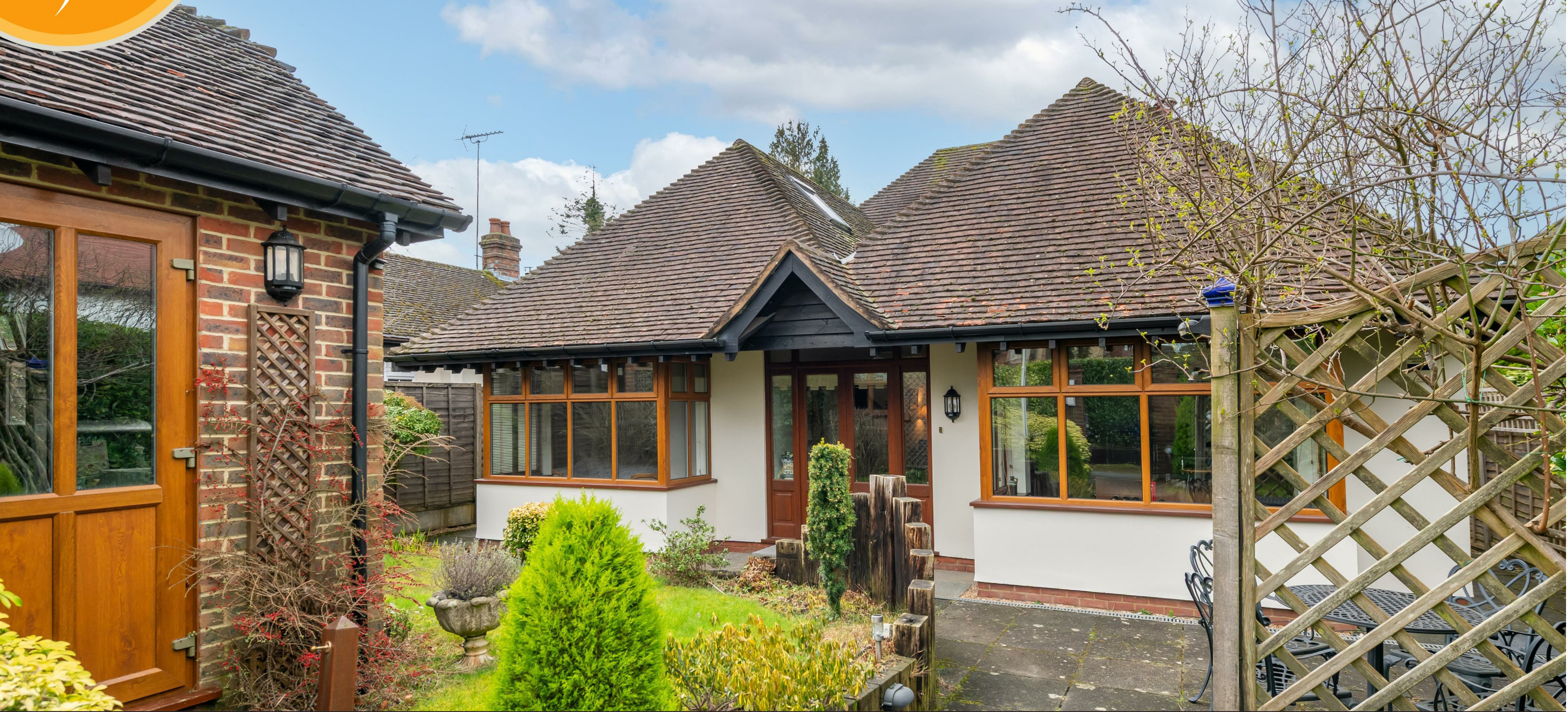
The Haven Church Road, Worth, Crawley, RH10 7RS Asking Price £875,000